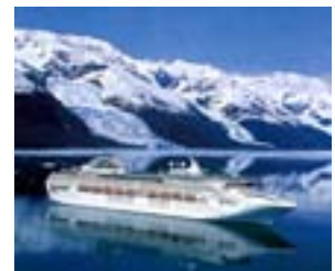
Scenic Cruising Glacier Bay National Park