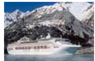
Scenic Cruising College Fjord