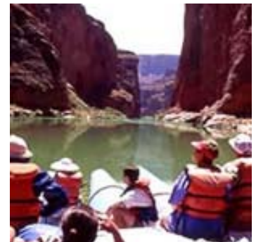
A lazy float