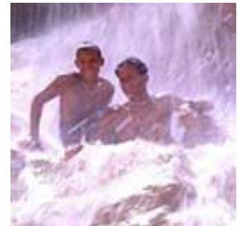
A secret waterfall